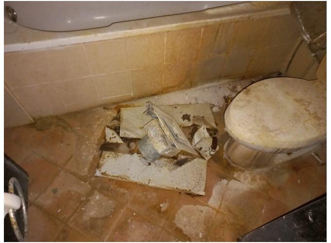
Apt 116 Water stains on the WC and Floor tiles