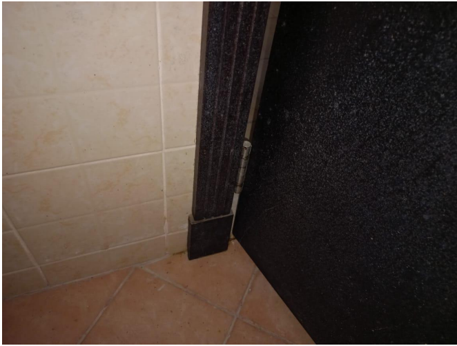
Apt 116- Water stain on the Door and door frame