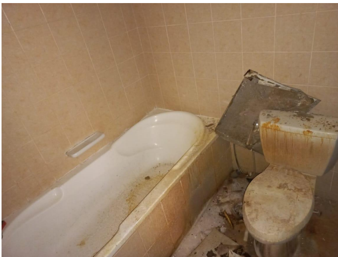
Apt 116-Water stain marks on the bathtub