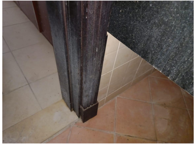
Apt 116- Water stain on the Door and door frame