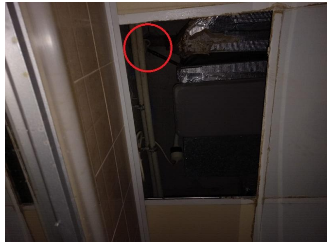
Wash basin drain pipe leaking at Apt116