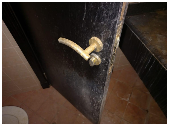
Apt 116- Water stain on the door handle