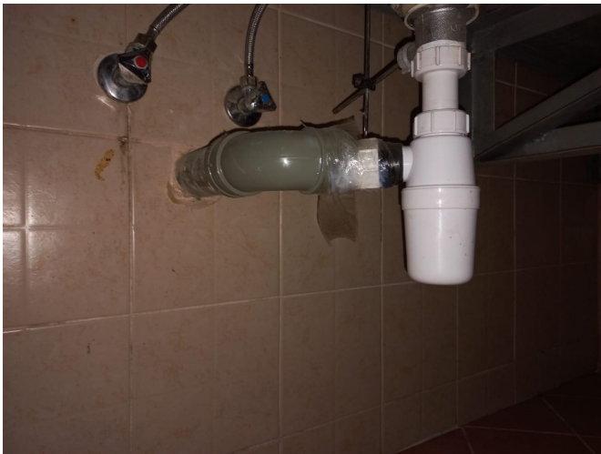
Wash Basin Drain pipe