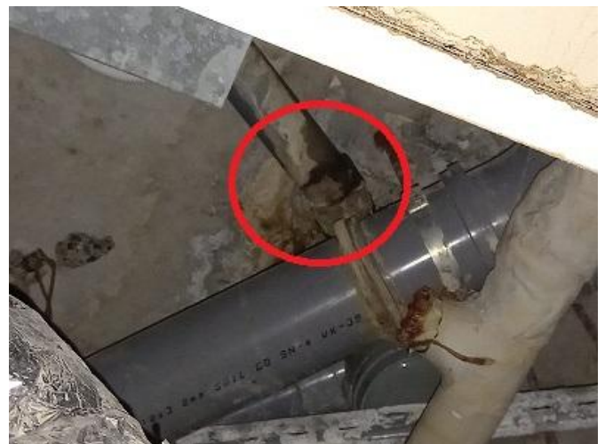
Bidet drain pipe leaking at Apt 116 master washroom ceiling