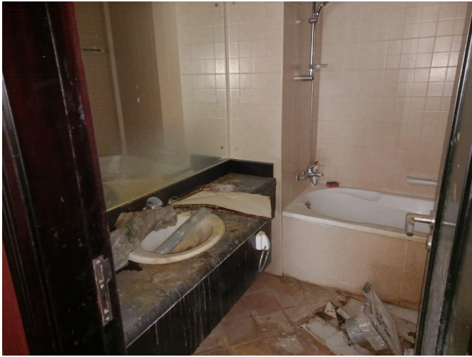
Apt 116 Water stain on the mirror, Wash basin & Counter